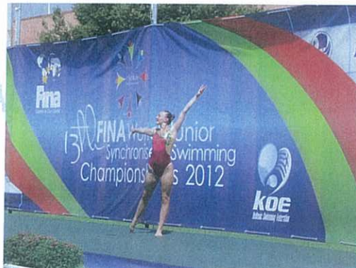
September 2012 - Volos Greece