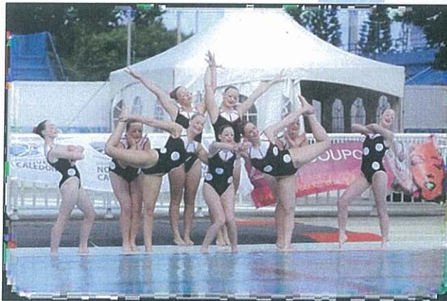
New Zealand South, Combo